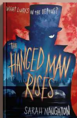
The Hanged Man Rises, Costa Book shortlisted.